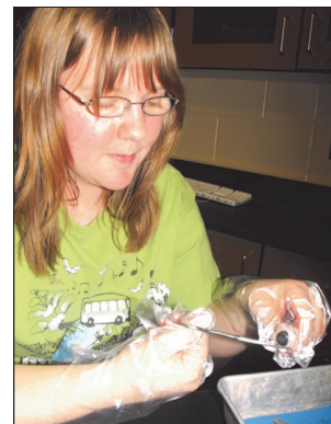
Eyeball dissection in Anatomy class.